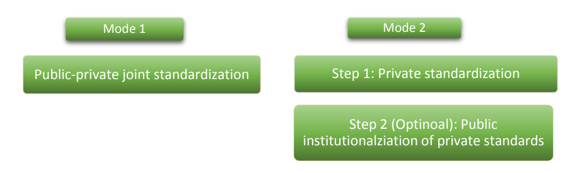
Diagram 1: Modes of Private-Sector Participation in Standard Setting

More concretely, private actors can take on a key role in standard setting through two main modes. The first mode is the joint development of standards with the government. The second mode is standard-setting solely by the private sector, enhancing existing or enacting otherwise absent standards. Once private standards have been enacted, the government can institutionalize private standards, such as through complete or partial adoption. Diagram 1 illustrates these two modes of private sector participation in standard setting.