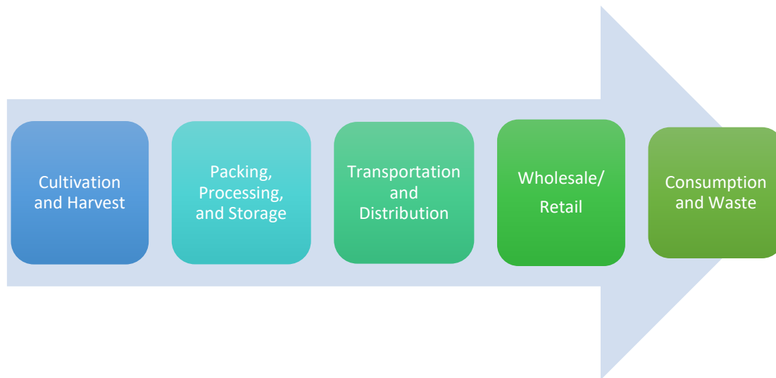
Figure 1: Kiwi Value Chain

Although kiwi is typically eaten fresh, it nevertheless passes through all main stages of the value chain, and can serve as a model for other fresh agricultural produce. A diagram of the kiwi value chain is shown in Figure 1.